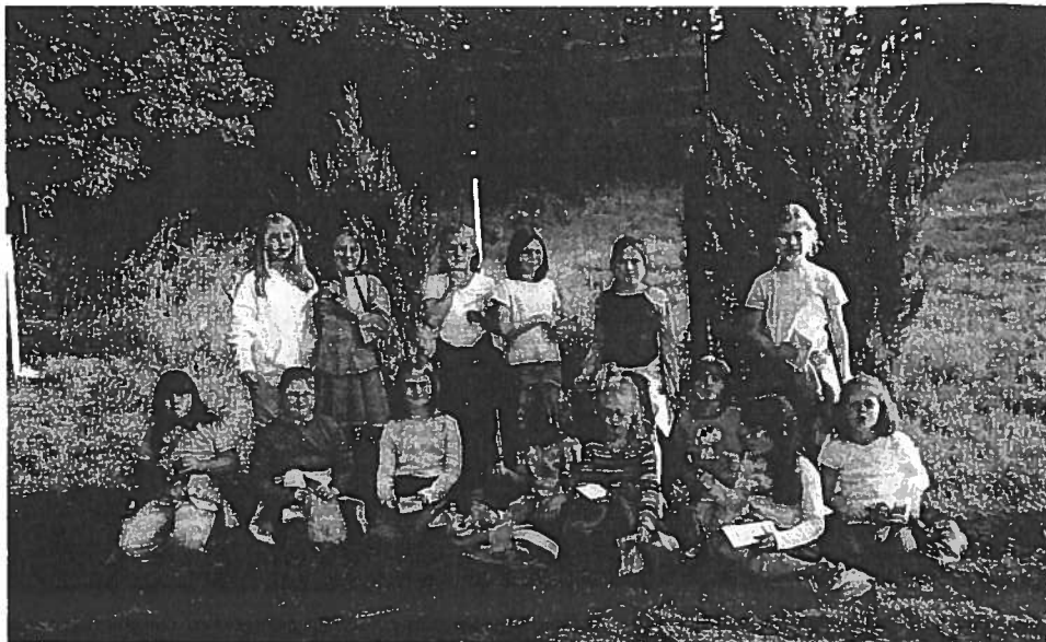
Ellington’s Girl Scout Troop 188 at McCann Family Farm

Should our participation with the American Chestnut Foundation become a reality, we would expect our chestnut “plantations” to be of keen interest to forestry groups as well as environmental study programs in local schools. The opportunity to participate in the re-establishment of one of America’s most admired trees has great appeal. Indeed, if the species can be revived, the chestnuts could well affect our woodlands in a highly beneficial way, with ancillary benefits extending into our wildlife population as well.